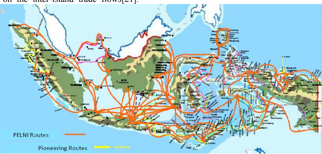
Figure 2. Nusantara Ship Route Network.

Almost all of the world's shipping lines pass through Indonesian maritime territory. Unfortunately, no Indonesian port is in the primary international port category that is acknowledged globally as able to serve international mother vessels. With reference to the issue of the nation's economy, Indonesia does not have a port system that is adequate in terms of performance and service, in the views of its users. In general, ports in Indonesia are lacking deep-water, missing out on private sector participation (investment) and are not competitive. Indonesia has a port system which is organized into a hierarchy system of approximately 1700 ports, including the 25 main 'strategic' ports (see figure 2).